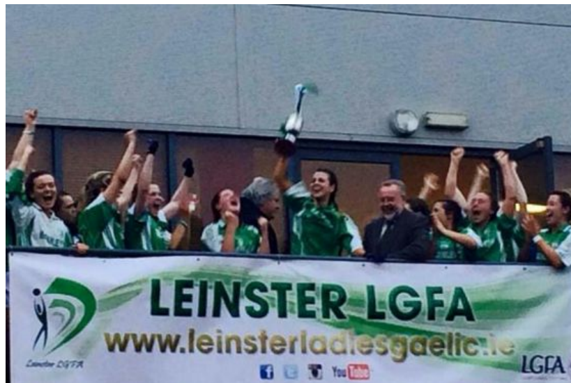
The victorious Ladies team are on the up!