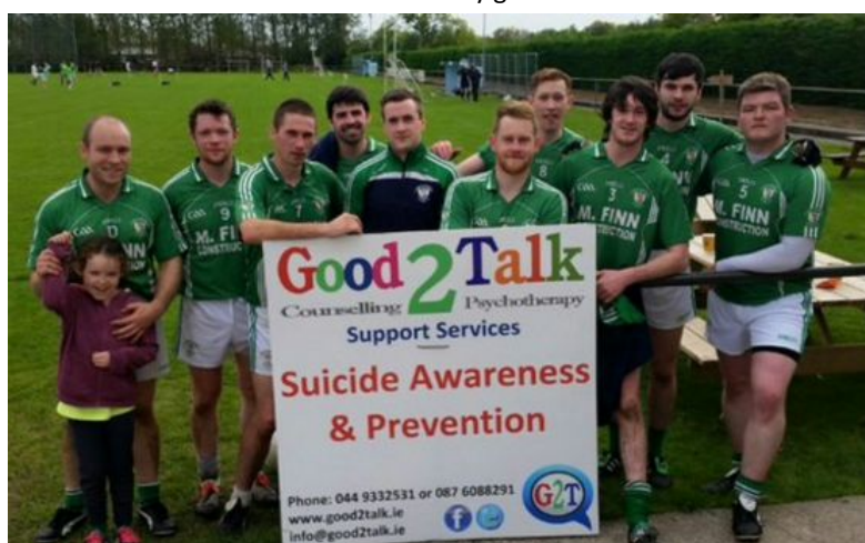
Milltown team that competed in the 7s tournament

The club supported some good causes during the year, including the Trek for Belnaleck GAA in Co. Fermanagh , who cycled to every club in the 32 counties to raise money to develop their club's grounds. We also entered the Mental Health Awareness 7s tournament in Shandonagh GAA in October for www.good2talk.ie and the lads gave a good account of themselves in a tournament run for a very good cause.