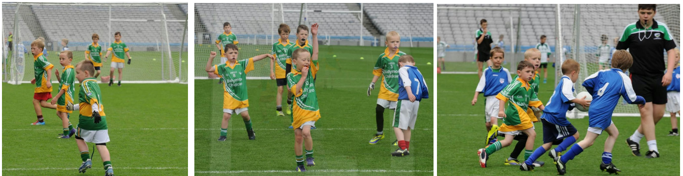
The U8s playing on the hallowed turf of Croke Park in July!

Our U8 squad took part in a number of blitzes throughout the season, two of which were hosted by Millmore and travelled away to the rest. They had 2 big days out where in June they attended a blitz in Cusack park where 2 teams took to the field and performed well and in July a squad of 21 and their mentors travelled to Croke Park to take part in national blitz. They really enjoyed the experience, a great day and season was had by all involved.