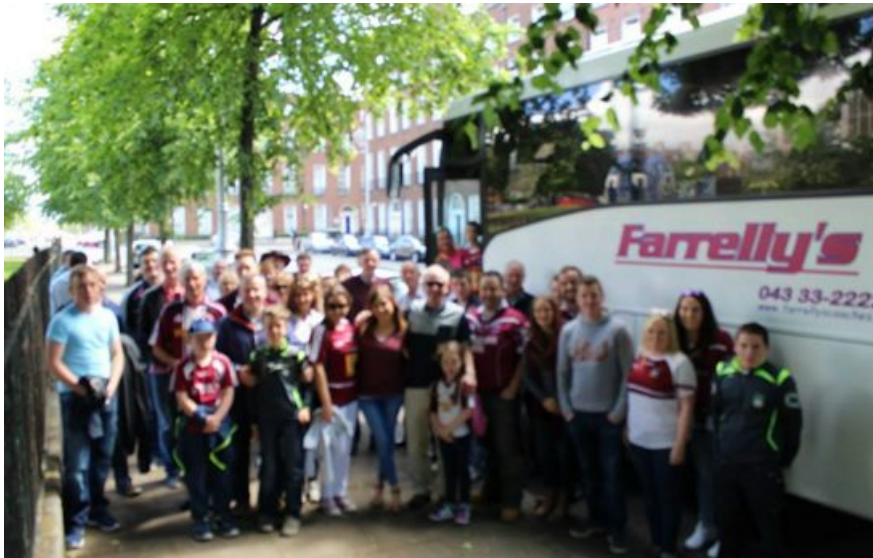
Milltown on tour to support the Lake County!