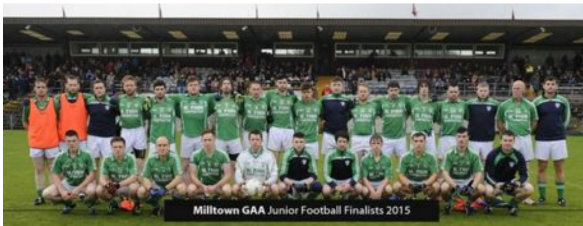
Milltown squad to play Ballycomoye in the JFC Semi Final

Our first outing in the championship was against Kilbeggan in Cusack park on 23rd May, a game which we won 4-10 to 3-5. We then went on to beat Ballycomoye (2-12 to 0-9) on 29th May in Springfield and draw with Multyfarnham on 13th June in Cusack park (0-12 to 2-6). We followed that game with a facile 5-20 to 0-1 win over Loughnavalley in Cusack park on 24th July. We then went on to beat Delvin 0-9 to 2-17 in Springfield on the 1st of August. The last meaningful game we were to play before the knockout stages was a 2-10 to 2-15 hard fought win over St Paul's in Kinnegad on 15th August. When St. Joseph's conceded the fixture on 12th August, we were forced to play against Multyfarnham in Cusack park on 23rd August to decide top spot. Multyfarnham just scraped the win by 2.11 to 2.10 to top the group.