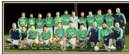
The 2015 panel prior to their Division 3 fixture against St.Lomans