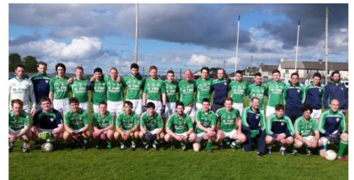
The Milltown panel pictured before taking on Ballycomoye in Springfield

This pairing will be a repeat of our first championship game in May so hopefully a massive difference can be made before then.